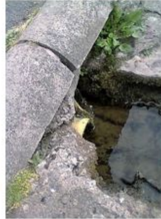
Diverted water now entering pond

dept. laid a new drainage channel consisting of clay pipes bedded on sand and covered with sand before recovering with earth. Apparently, the clay pipes were broken before they were covered with the topsoil. This drainage channel ran down the side of the north walkway and the water flow was diverted into the pond as part of the project.