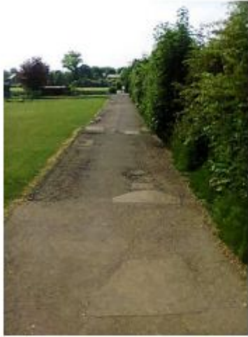
Extended width of Tarmac covering drainage route and trees planted

dept. laid a new drainage channel consisting of clay pipes bedded on sand and covered with sand before recovering with earth. Apparently, the clay pipes were broken before they were covered with the topsoil. This drainage channel ran down the side of the north walkway and the water flow was diverted into the pond as part of the project.