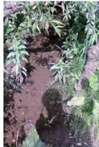
Water still flowing after long dry spell

There are SEPA regulations concerning land drainage and watercourses that RDC as the riparian owner, will be aware of. It does however raise an obvious question to the layman that diverting the flood water, whatever its point of origin, into the proposed SUDS in the middle of the railway will always be subject to a constant in flow of water and may never go empty. The large volume of storm water that it will be required to cope with will have to soak away but where will it go? Will it establish a new Lady Burn route? A Hydrogeological study would be required to establish this along with the pressure a full SUDS will exert on the banking/ground adjacent to the pond.